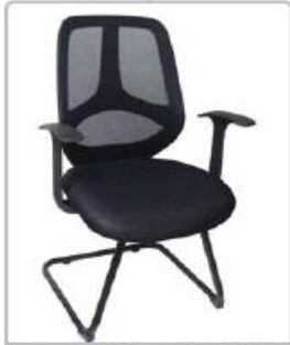
Guest Chair SMG 4105

Ergonomic breathable mesh chair. SMT 4105 W:19" D:18.5" H:39"-42" SH: 18.5"-22" SMG 4105 W:19" D:18.5" H:39" SH:19"